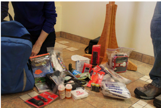
Look at all the stuff you can fit.