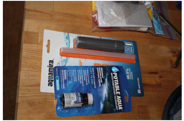
You're going to need water. Have 1 bottle and put water purification supplies in your pack