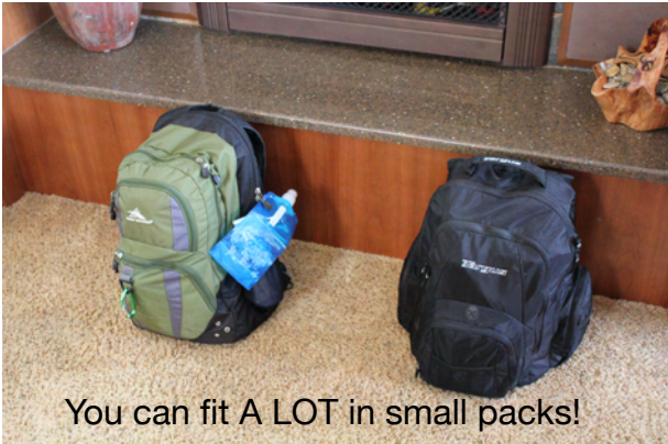
You can fit A LOT in small packs!

These neighbors have put to use some very fine ideas in assembling their go-kits. We bring you highlights here and hope you will find them useful.