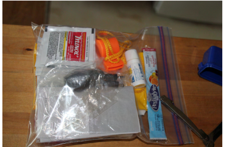
You can organize over-the-counter meds and 1st aid supplies in ziplock bags.