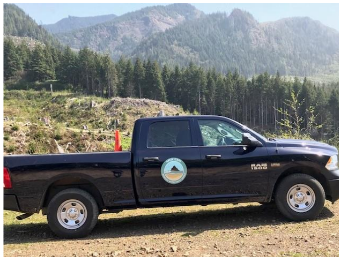
New work truck with Angora Peak in the background

The Water District recently purchased a 2018 Dodge Ram 1500 Tradesman for just under $29,000. The truck's use is split between the Water and Sanitary Districts and is utilized for everything from reading meters to inspecting the watershed, responding to storm related emergencies, working in the hills at the irrigation site, and much more. The crew cab truck has room for tool storage or seating available for five passengers. A canopy, ladder rack, and bed slide will be installed later this month. Look for "True Blue" in a neighborhood near you!