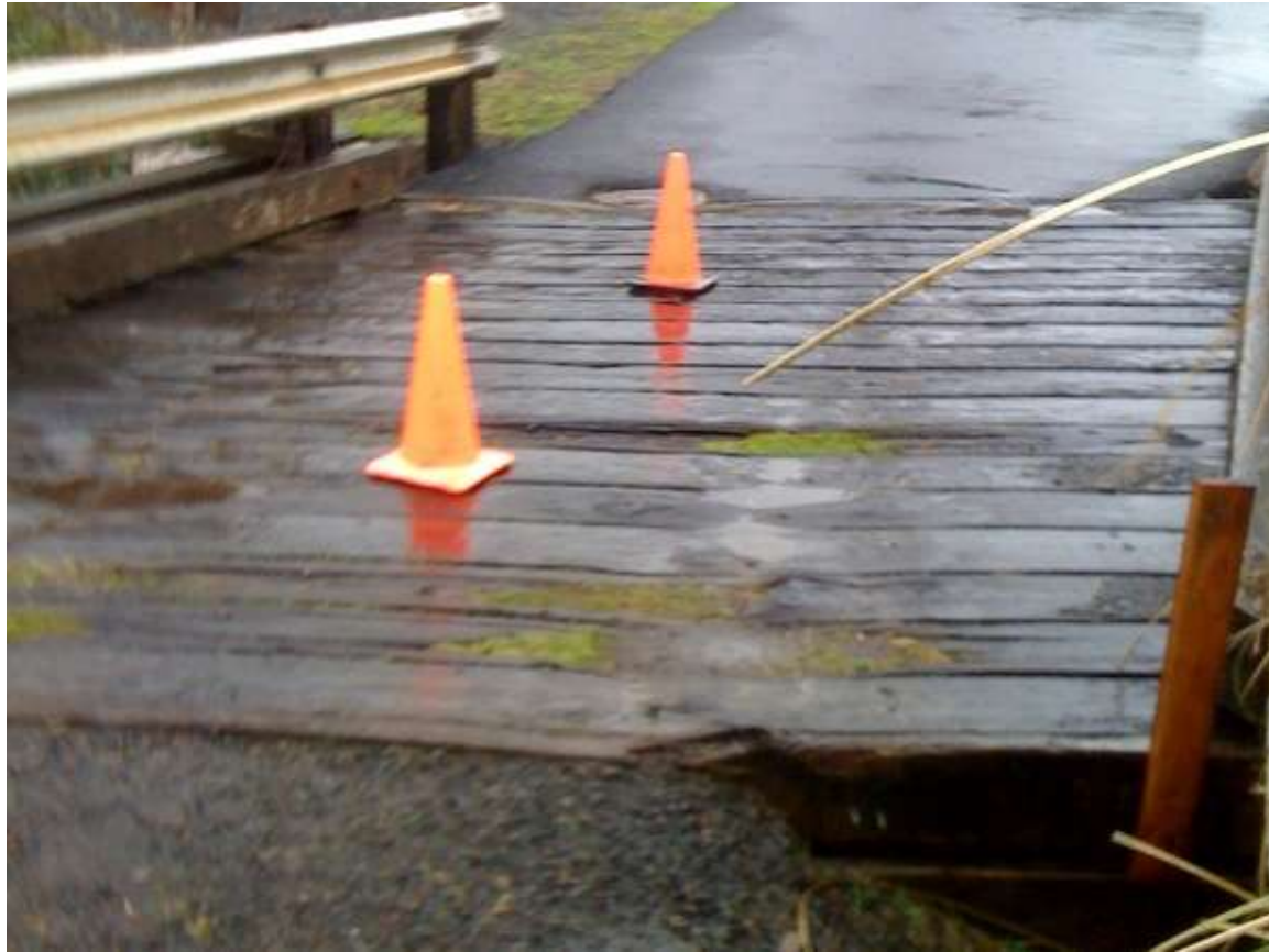
Asbury Creek Bridge